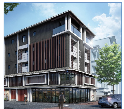
Exterior of the hotel

JR Kyoto Line / Kintetsu Railway Kyoto Line / Subway Karasuma Line…a 12-minute